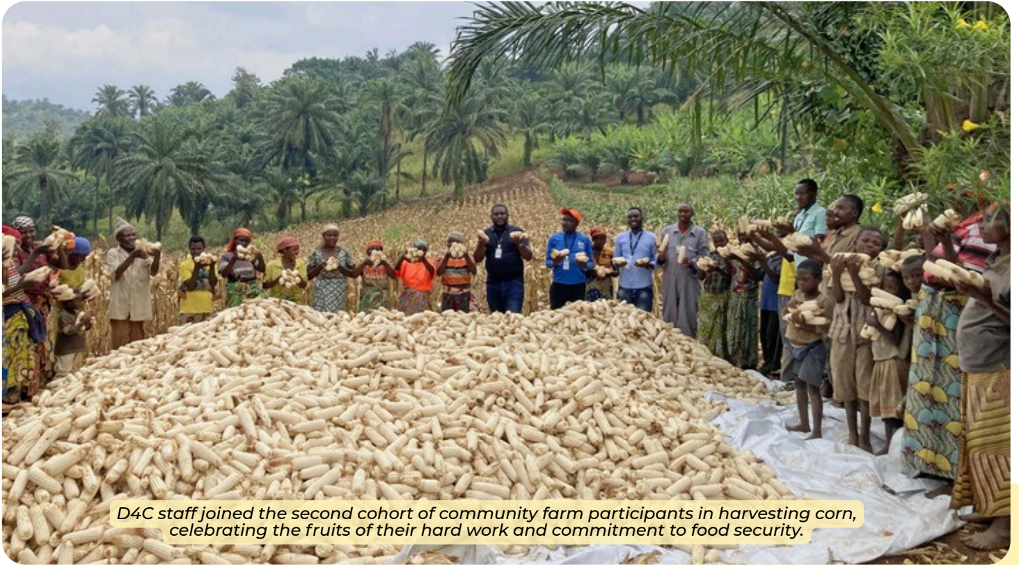
D4C staff joined the second cohort of community farm participants in harvesting corn, celebrating the fruits of their hard work and commitment to food security.