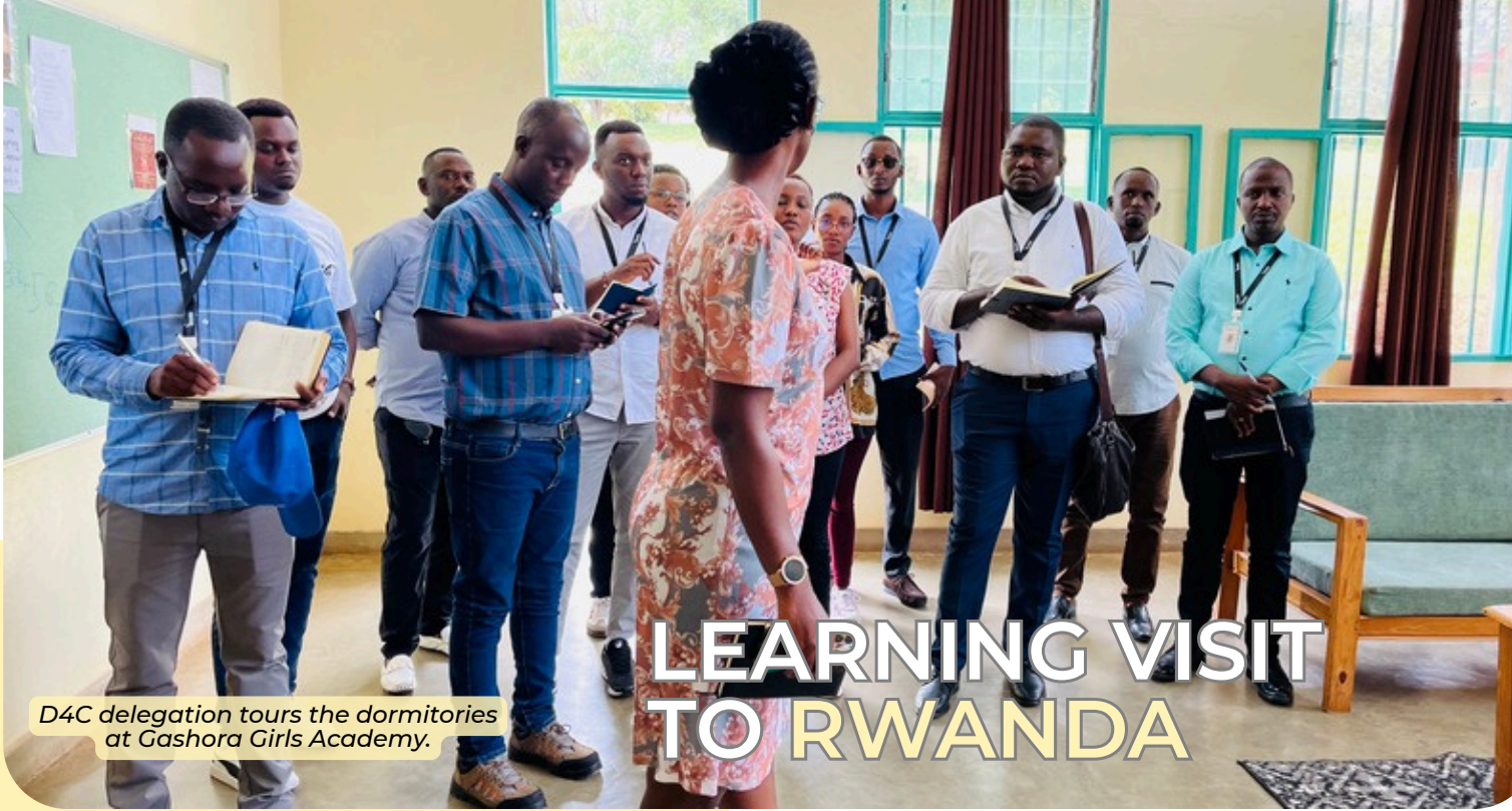
D4C delegation tours the dormitories at Gashora Girls Academy.