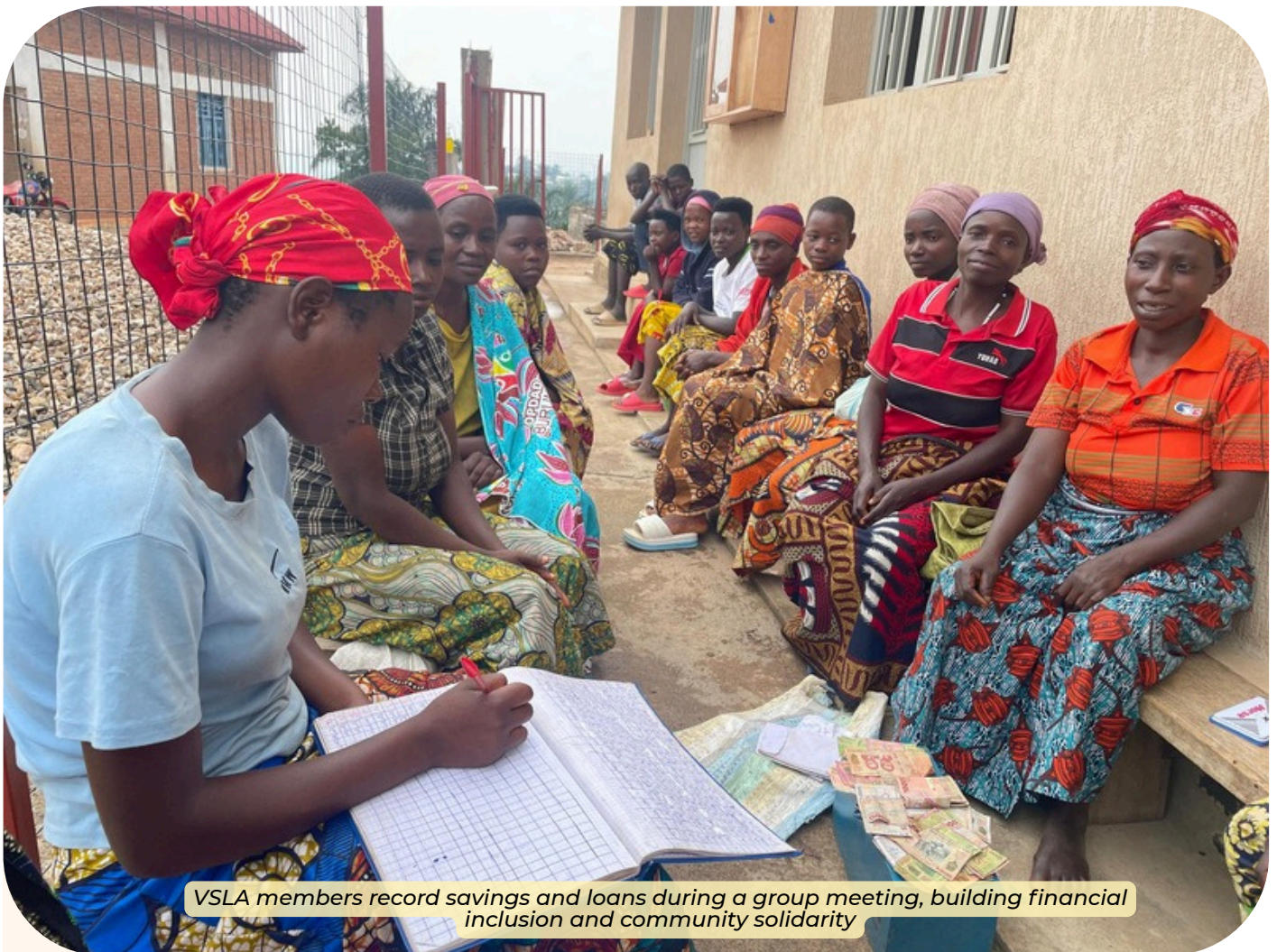
VSLA members record savings and loans during a group meeting, building financial inclusion and community solidarity