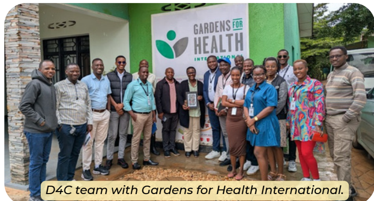
D4C team with Gardens for Health International.