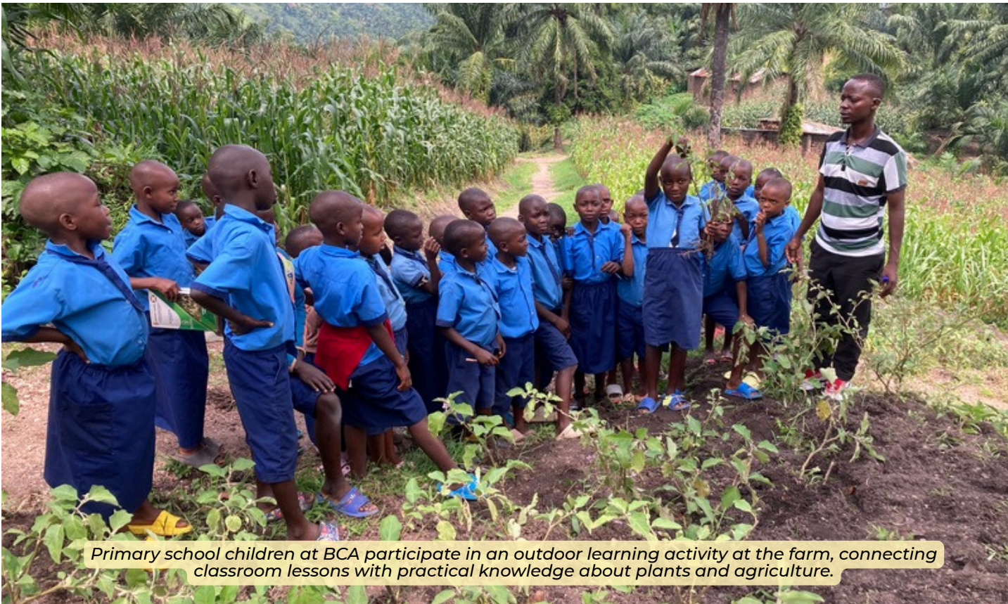
Primary school children at BCA participate in an outdoor learning activity at the farm, connecting classroom lessons with practical knowledge about plants and agriculture.