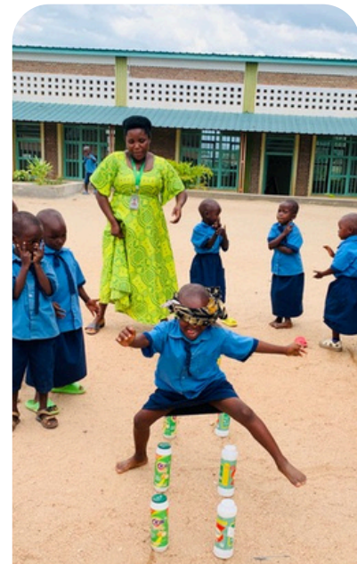
A preschool child builds self-confidence and courage through a fun blindfold jumping activity.

Through the American Shelf, 291 beneficiaries accessed English learning, reading activities, library resources and introductory IT exposure to help them build confidence, curiosity and practical digital skills among children and youth.