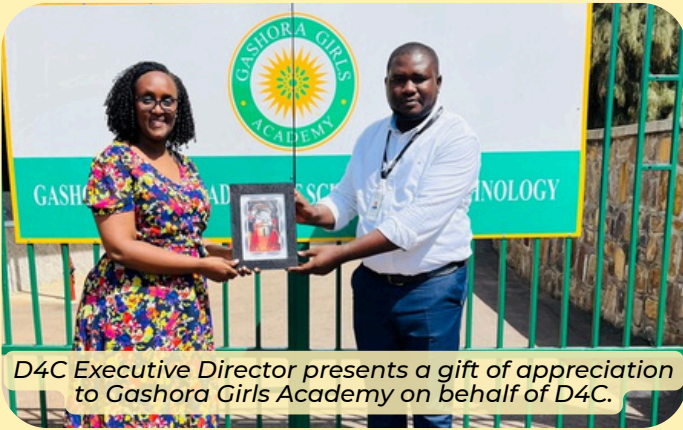
D4C Executive Director presents a gift of appreciation to Gashora Girls Academy on behalf of D4C.

Back in Burundi, we’re applying key lessons by strengthening learner-centered classrooms, expanding student enrichment and improving our nutrition, farm and campus systems.