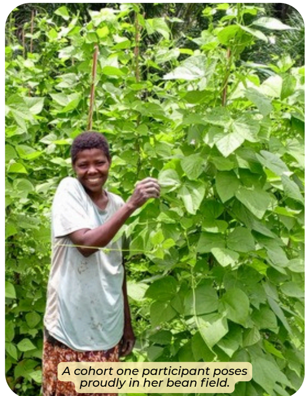
A cohort one participant poses proudly in her bean field.

In addition, 46 women participated in the farming school program, helping strengthen both household nutrition and income generation.