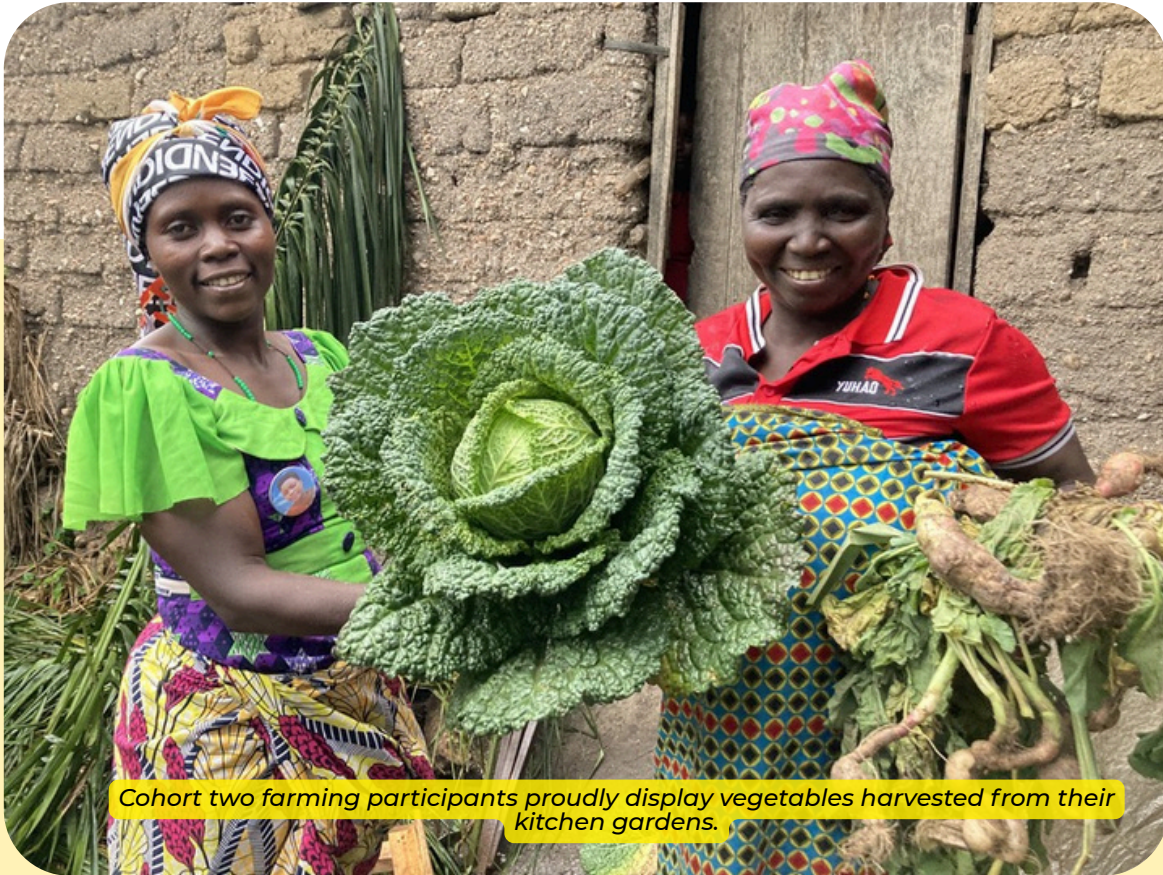
Cohort two farming participants proudly display vegetables harvested from their kitchen gardens.

During Q1, Dreaming for Change continued to strengthen household food security and livelihoods through its community farming program. The program worked with two farmer cohorts: one cohort had already graduated and continued to receive follow-up support, while the second cohort remained active and continued to receive training and ongoing technical support.