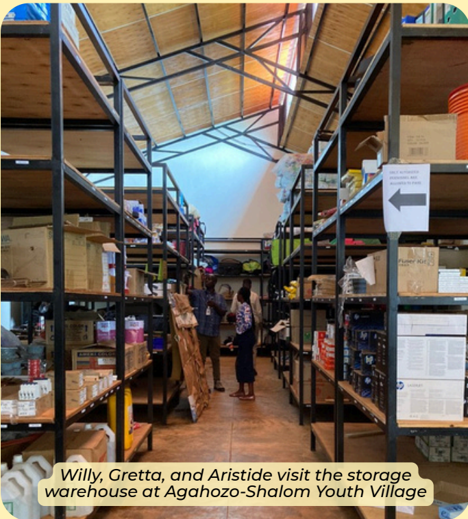
Willy, Gretta, and Aristide visit the storage warehouse at Agahozo-Shalom Youth Village