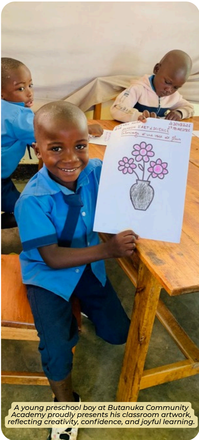
A young preschool boy at Butanuka Community Academy proudly presents his classroom artwork, reflecting creativity, confidence, and joyful learning.